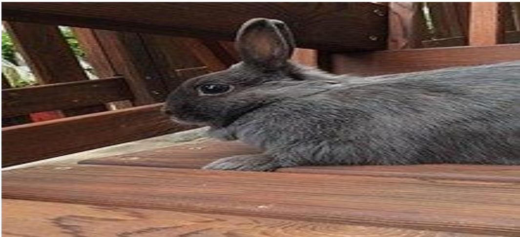
A Netherland Dwarf rabbit on a swing

Pets provide their owners (or "guardians") both physical and emotional benefits. Walking a dog can provide both the human and the dog with exercise, fresh air and social interaction. Pets can give companionship to people who are living alone or elderly adults who do not have adequate social interaction with other people. There is a medically approved class of therapy animals, mostly dogs or cats, that are brought to visit confined humans, such as children in hospitals or elders in nursing homes. Pet therapy utilizes trained animals and handlers to achieve specific physical, social, cognitive or emotional goals with patients.