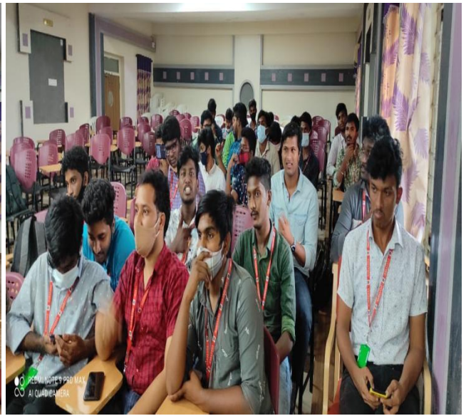
Students enthusiastically presenting and waiting for presentation