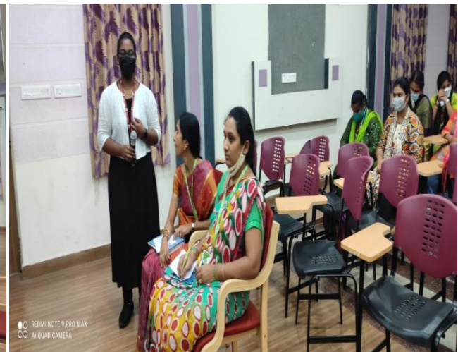
Guests viewing the presentation